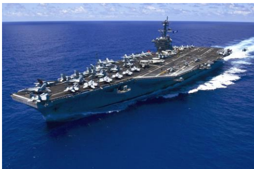
USS Carl Vinson