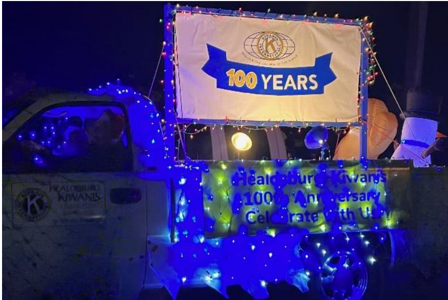
The Healdsburg Kiwanis entry

The annual Geyserville Lighted Tractor Parade was held on November 25, 2023. This is a fun event drawing a large crowd of spectators lining the street, rain or shine! No rain this year, but a very cold. The Healdsburg Kiwanis Club entered in 2022 for the first time to kick off our 100 th anniversary celebration and we continued the new tradition this year.