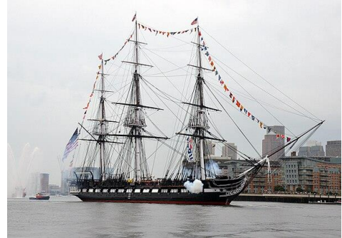
The USS Constitution

Commissioned in March 1982, the USS Constitution is 1,092 feet long and carries a crew of 6,012 officers and enlisted sailors. It accommodates 90 fixed wing aircraft and helicopters.