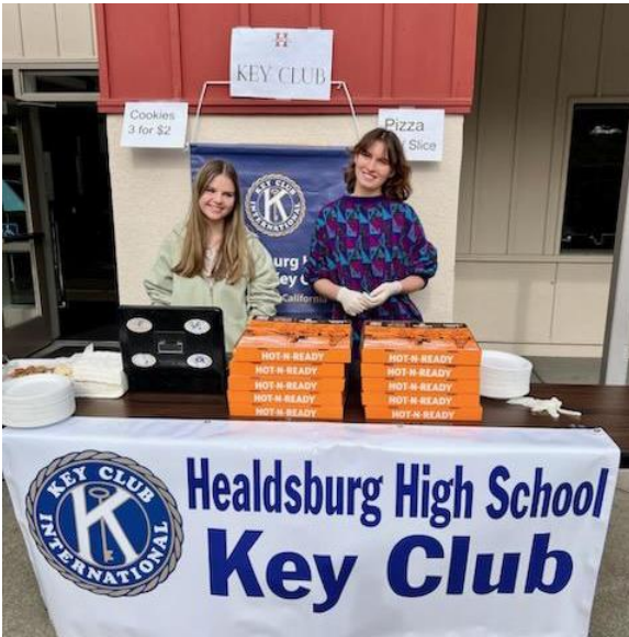
Fundraiser selling pizza and cookies