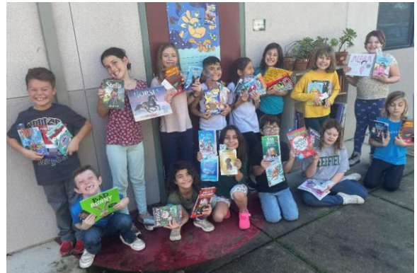
Our first class of "student selected" and "Kiwanis sponsored" books arrived at Alexander Valley Elementary School

A busy time of year goes without saying and many of the local 3rd graders will be choosing the Scholastic books that we are sponsoring at $25 a student.