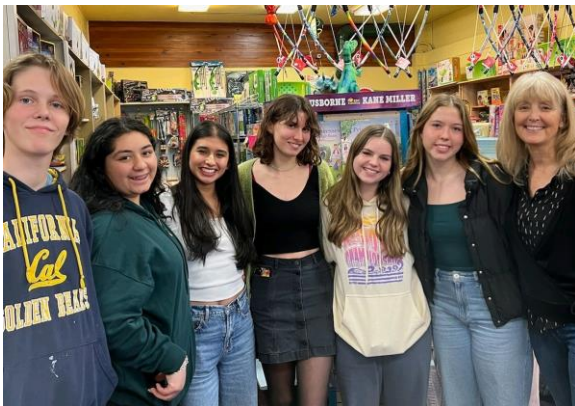
Buying toys lends itself to great smiles!