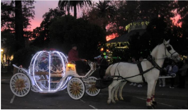
The Carriage Rides

Gross receipts from mulled wine, beer, and soda totaled $4,600. Estimated expenses were about $1,100 leaving net proceeds of about $3,500. We also received $165 in Vocational Scholarship Tips. Special thanks to Ted Draper for furnishing the horses and carriage for the deeply discounted price of $600. Ted expressed great appreciation for a job well done by the Key Club crowd control team, protecting the horses from the enthusiastic crowd.