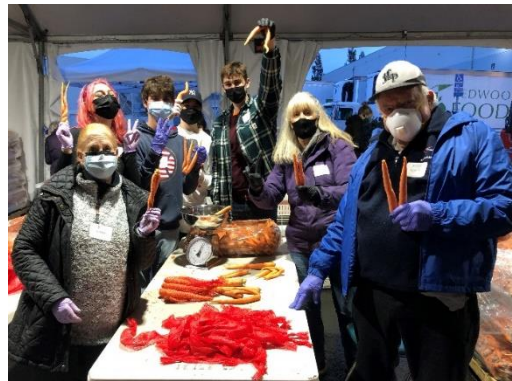
What's up Doc???? Bugs would be thrilled!