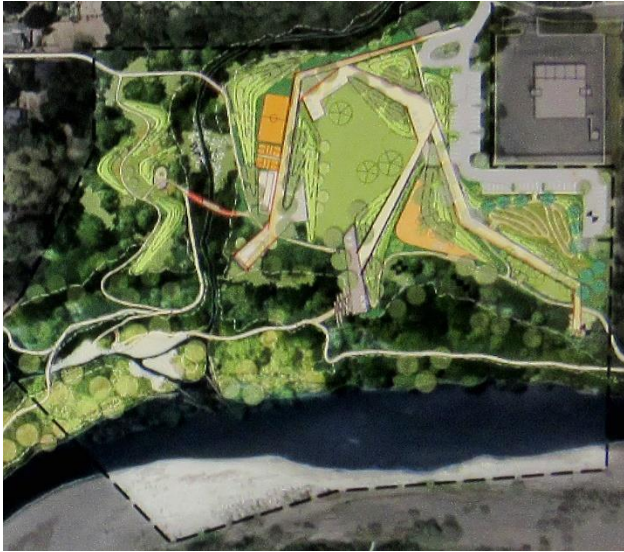
Badger Park Plan