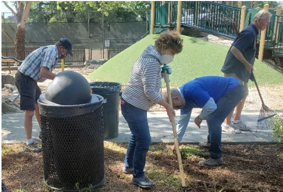
Weeding & raking up