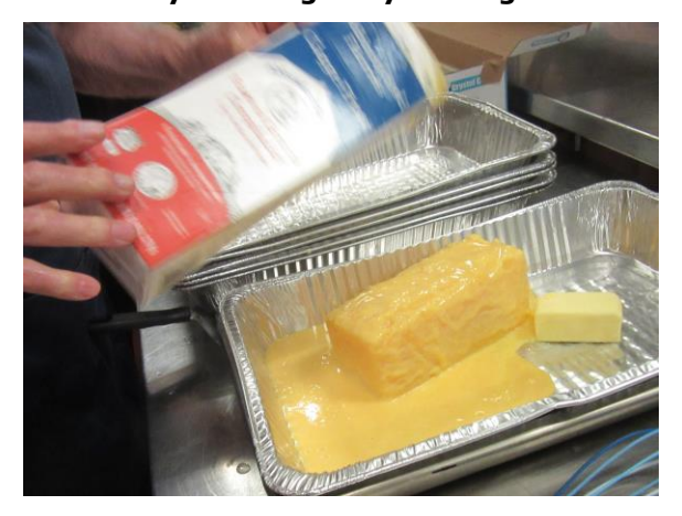
Who forgot to thaw the eggs?!