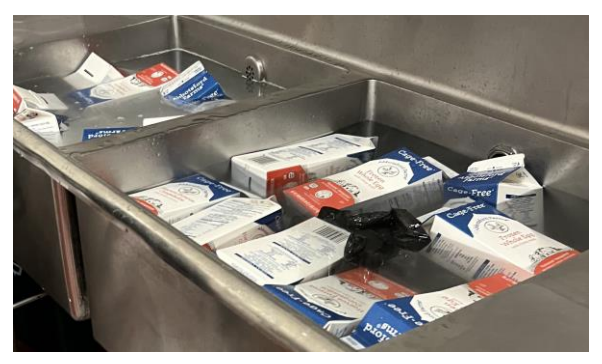
The great frozen egg challenge partial thaw in hot water additionally challenged by leaking sink drain