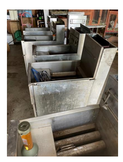
Deep fryers waiting to be serviced, repaired and cleaned