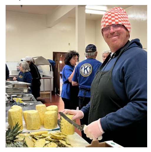
Scholarship Night at the Raven