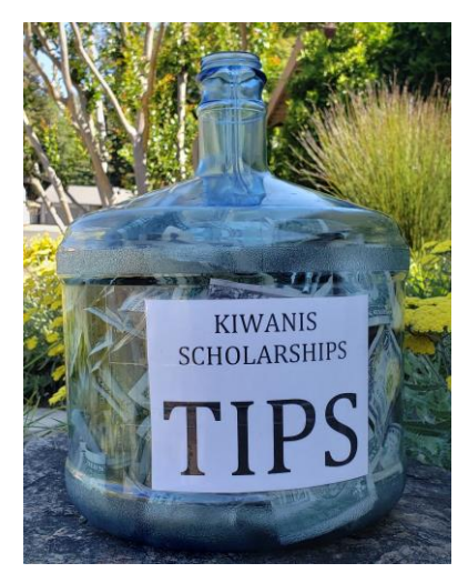
Now we need to figure out how to get the money out Harry to the rescue with skillsaw

The large tip jug at the FFA food trailer yielded a total of $458.35 from generous customers. The guessing contest held at our May 31 meeting was won by Rolando with the closest guess of $436.50.