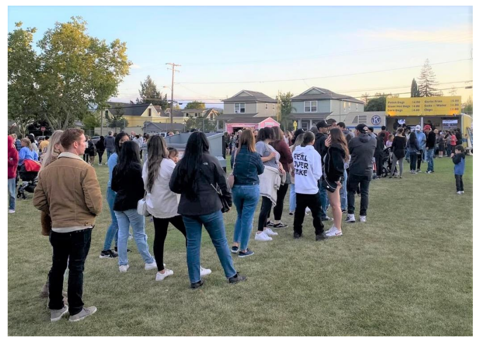
The long line of customers on Thursday night

After a 2-year pandemic hiatus, we are back in business at the FFA Fair. Our food trailer was ready for after extensive maintenance, repairs and cleaning.