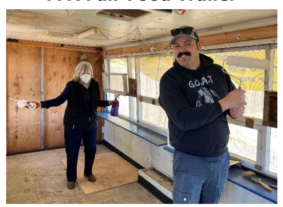
Final trailer cleanup