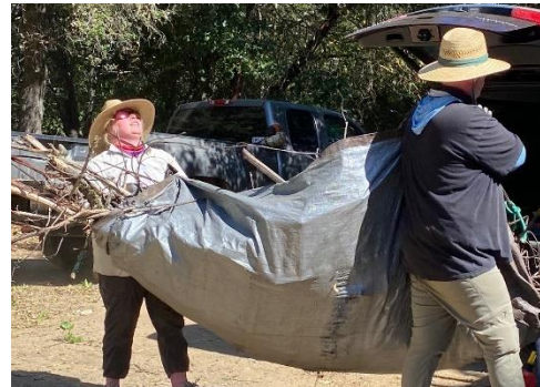
Haul it away