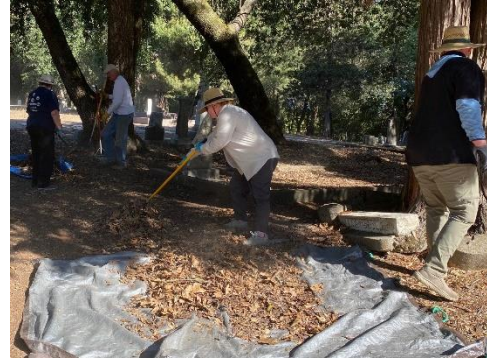
More raking up