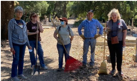
The museum volunteers