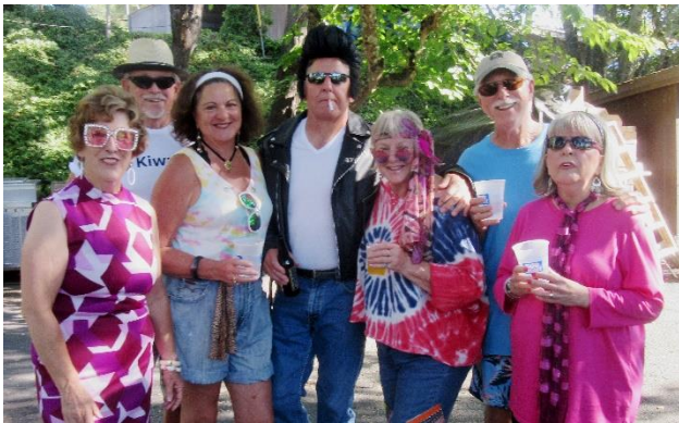
Some of the far-out outfits

The event was a celebration of the 60's. Members showed up wearing their most GROOVY far-out outfits.