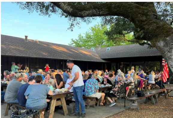
A Large crowd enjoys steak & corn