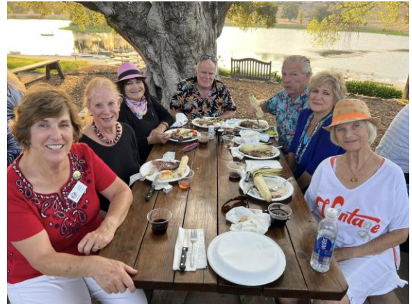
Healdsburg Kiwanians digesting steak & Corn