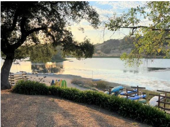
View at the Vineyard Club

Held at The Vineyard Club in Geyserville, the menu included BBQ Steak and Corn on the Cob dinner with all the trimmings (big surprise??). Wine was provided with dinner and there was a donation bar for serious imbibers.