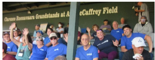
A good turn out of Kiwanians enjoy the game