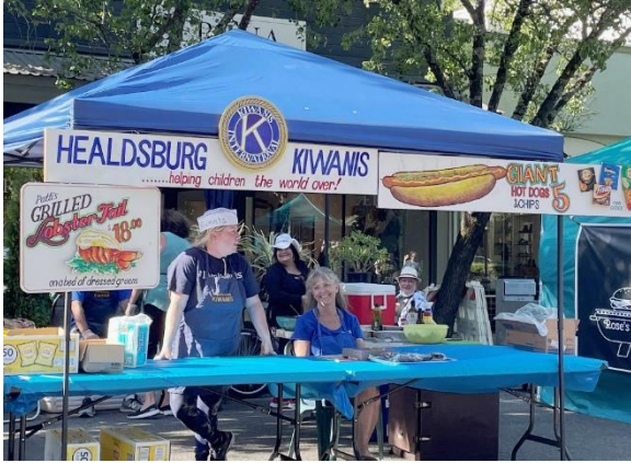
Kiwanis food sales booth at the Tuesday night concert on the Plaza