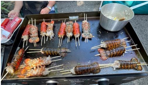
Lobster tails on the grill