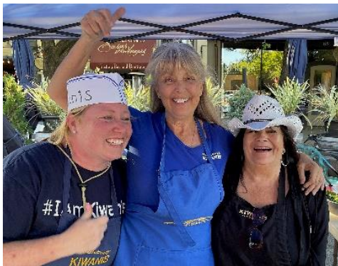
Three of our most talented sales people