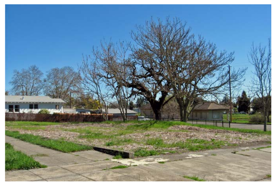
"Before" View of Future Pocket Park

On the morning of April 5, hardy members of Kiwanis, Key Club and Boy Scout Troop 21 will meet at the corner of Fitch and Mason Streets with rakes, shovels and other tools in hand to complete Phase 2 in the creation of a small pocket park. Boy Scout Troop 21 Eagle Scout Candidate Cutler Price is spearheading the final two stages as his Eagle Scout Project. Last fall the Healdsburg High Key Club along with friends completed stage one at the park.