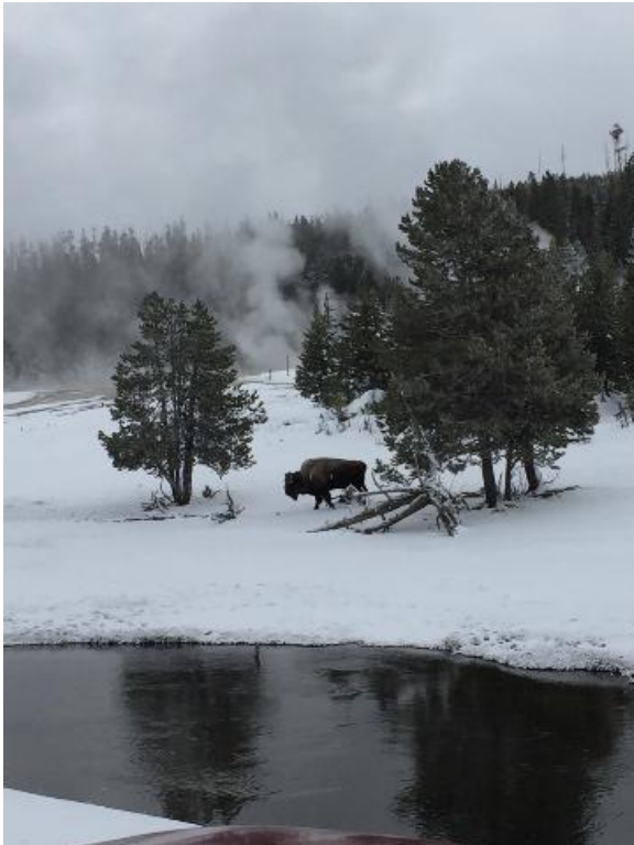
The brutal Yellowstone Winter

Mar 28: Evening Meeting - Two Truths and a Dream Wish