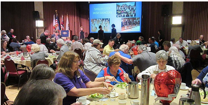
Enjoying the Inter-club Luncheon

Interesting and informative seminars were held throughout the day and included Communications and Social Media, Service Leadership Programs, Kiwanis Children’s Fund, Youth protection Guidelines, Club Service Projects and Fundraising, and Kiwanis Insurance and Risk Management.