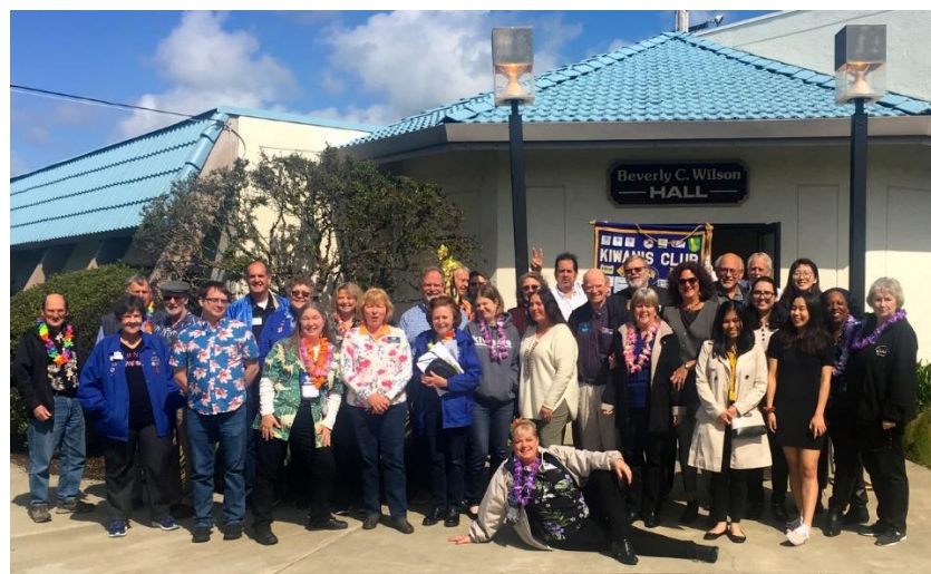
Division 32 Kiwanians at the Petaluma DCM