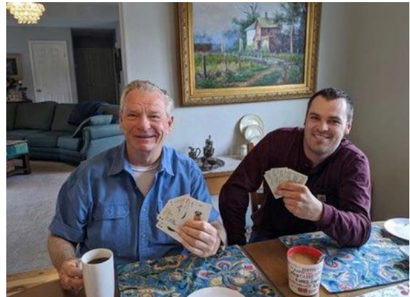
Two scoundrels hunkered down and sheltering in place, but not 6 feet apart Fines in order?