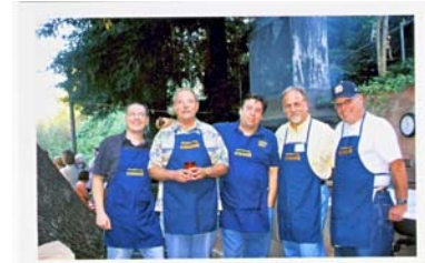
2010 BBQ Kitchen Crew