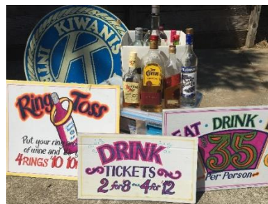
All dressed up and no place to go Save the stuff for next year