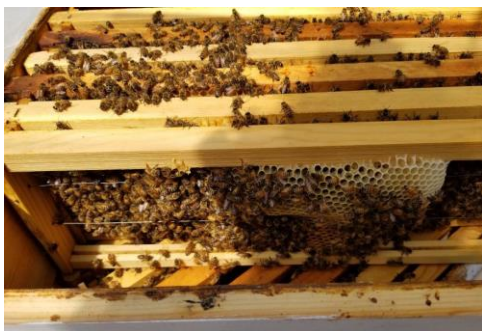
The girls building honeycomb and tending to the capped brood

I inspected my hives today. I don't think I will get as much honey this year.