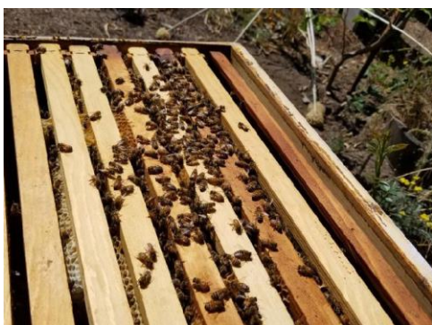
View of open hive

There is more honey in this box, about 30 pounds. When the 8 frames in the box are loaded with honey, it weighs about 50 pounds. I hope my back holds out this harvest season (Sept./Oct.).