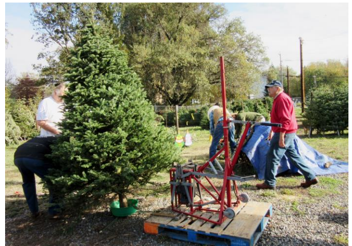
First customers on opening day, Black Friday Gross sales for the first two days were over $12,000