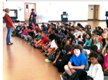
Third graders at Fitch Mountain School waiting for their dictionaries