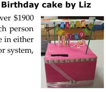
The collection box

Thanks to the generosity of attendees, over $1900 was raised to supplement our admin. fund. Each person was asked to donate an amount equal to their age in either pennies, nickels, dimes, quarters or dollars – honor system, no questions asked.