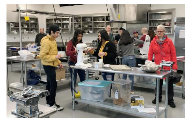
Visiting the culinary class