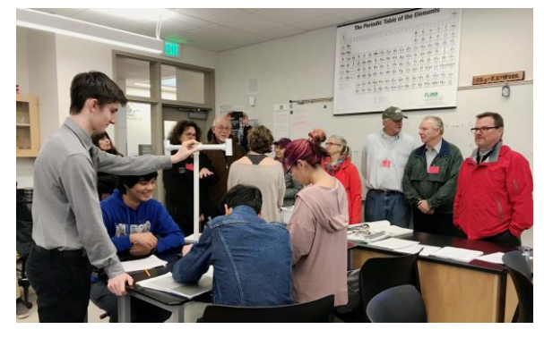
Visiting the science lab