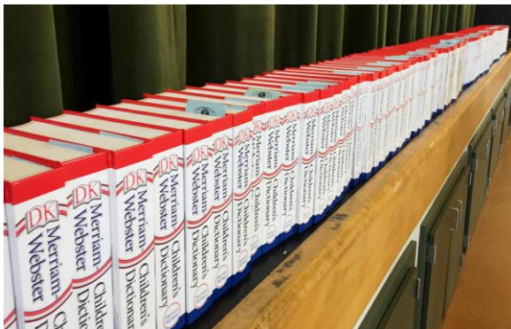
90+ dictionaries lined up for distribution at Fitch Mountain School

The Healdsburg Kiwanis First Book Project for 2020 was completed during January. A total of 176 dictionaries were given to every third grader in Fitch Mountain Elementary, St. Johns, Alexander Valley, West Side and Healdsburg School. This marks the 19 th year of the program with about 3600 dictionaries distributed since the program's inception. The total cost to the project fund, including sales tax, was $2875 (16.33 per dictionary).