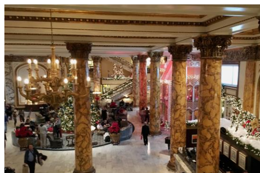
The Fairmont lobby at Christmas time