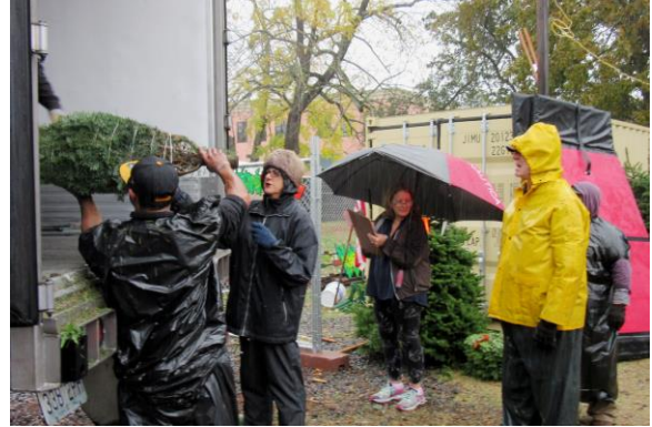
Unloading the final shipment of trees in the rain