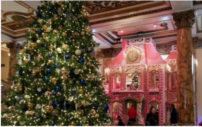
Christmas tree and gingerbread house in the Fairmont lobby