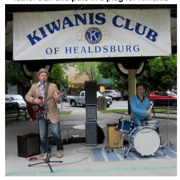
Live entertainment was provided at the Plaza and several locations along the race route