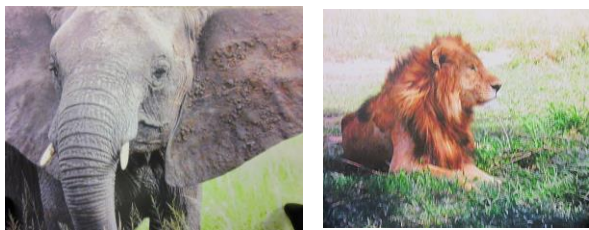
Here are two of Denny's favorites

The legendary plains of the Serengeti have one of the densest concentrations of wildlife on Earth. Thomson's gazelle, Cape buffalo, and elephant vie for survival here amidst grand backdrops, such as magnificent Tarangire National Park, and Ngorongoro Crater, a twelve-mile-wide, 2,000-foot-deep caldera. www.oattravel.com