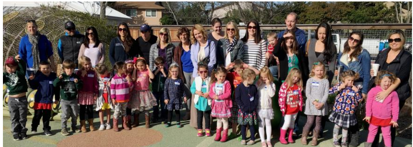
Live Oak Nursery School children and their parents visit the Children's Museum on February 24