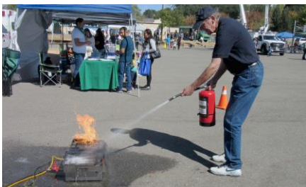
Guy puts out a fire