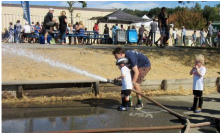
Learning how to put out a fire