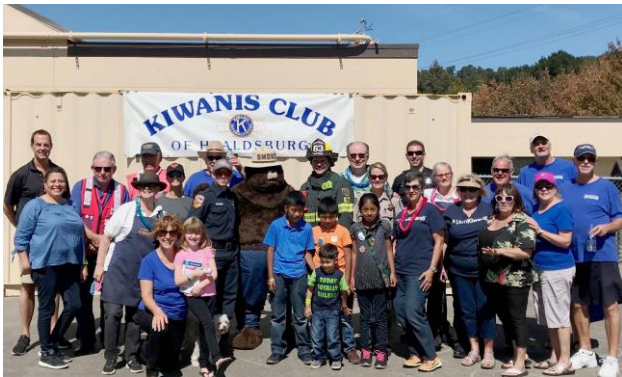
Some of the Kiwanians and other participants in the 2018 Safety Fair

Saturday September 22 was a beautiful fall day for the very successful second annual Kiwanis Safety Fair sponsored by AT&T and the Bear Republic. Over 500 children, parents and other participants enjoyed demonstrations and learning about safety from the various participating groups.