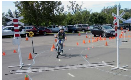
Learning bike rules of the road