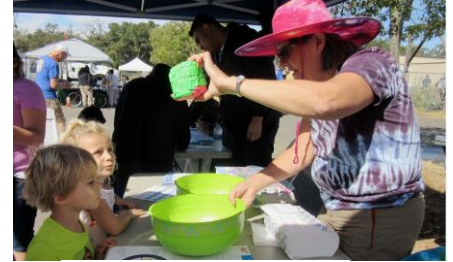
Learning how a helmet protects an egg (and your head)