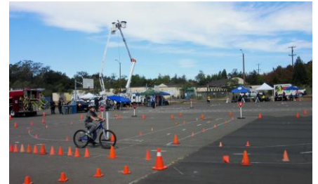
The bike rodeo course