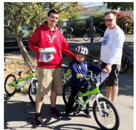
Ready for the rodeo course