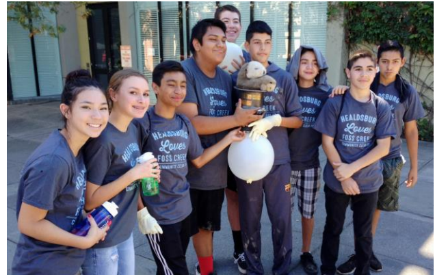
HHS Key Club Crud Collection Team winners of the coveted Crud Cup

Congratulations to the HHS Key Club, winners of the crud cup.