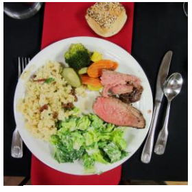
More photos on page 3